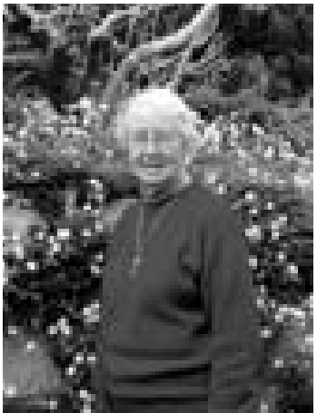
Sister Shearman will soon return to the United States filled with memories of Malta and its people.

Wayside chapels dot the landscape of Malta, which dates its strong Christian heritage to Saint Paul's shipwreck on the island's coast.