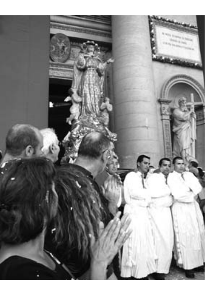
Maltese and tourists enjoy the country's numerous parish feasts.

driven first from the Holy Land and then from the Greek island of Rhodes, provided prosperity and stability as Malta entered into the most glorious period of its history. In 1565 the Ottoman Turks attempted to invade Malta in what is known as the "Great Siege." The Knights and stalwart Maltese triumphed, saving themselves and Europe from the Ottoman Turks.